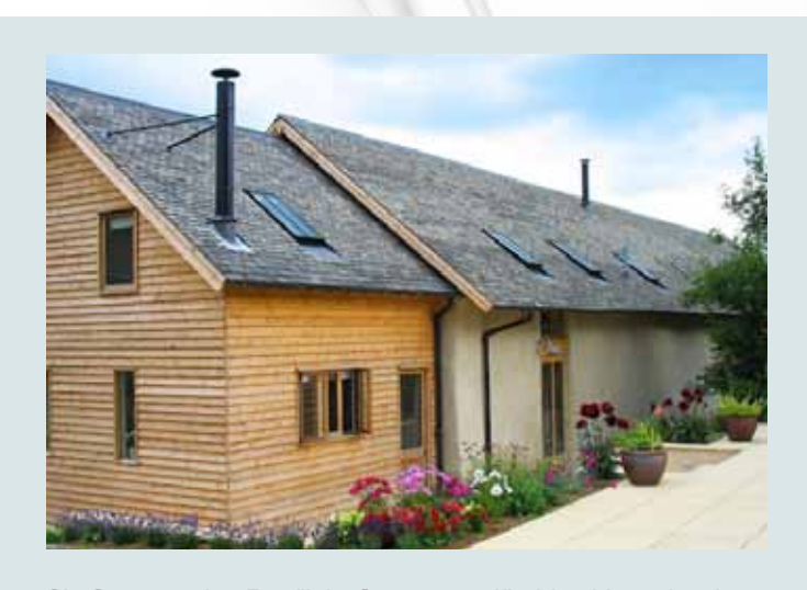
Six Conservation Rooflights® were specified for this project in a range of sizes.

The local conservation officer was involved in the project and approved the original Conservation Rooflight® due to its truly sympathetic appearance and the ability to flush fit the rooflights to blend seamlessly into the roof.