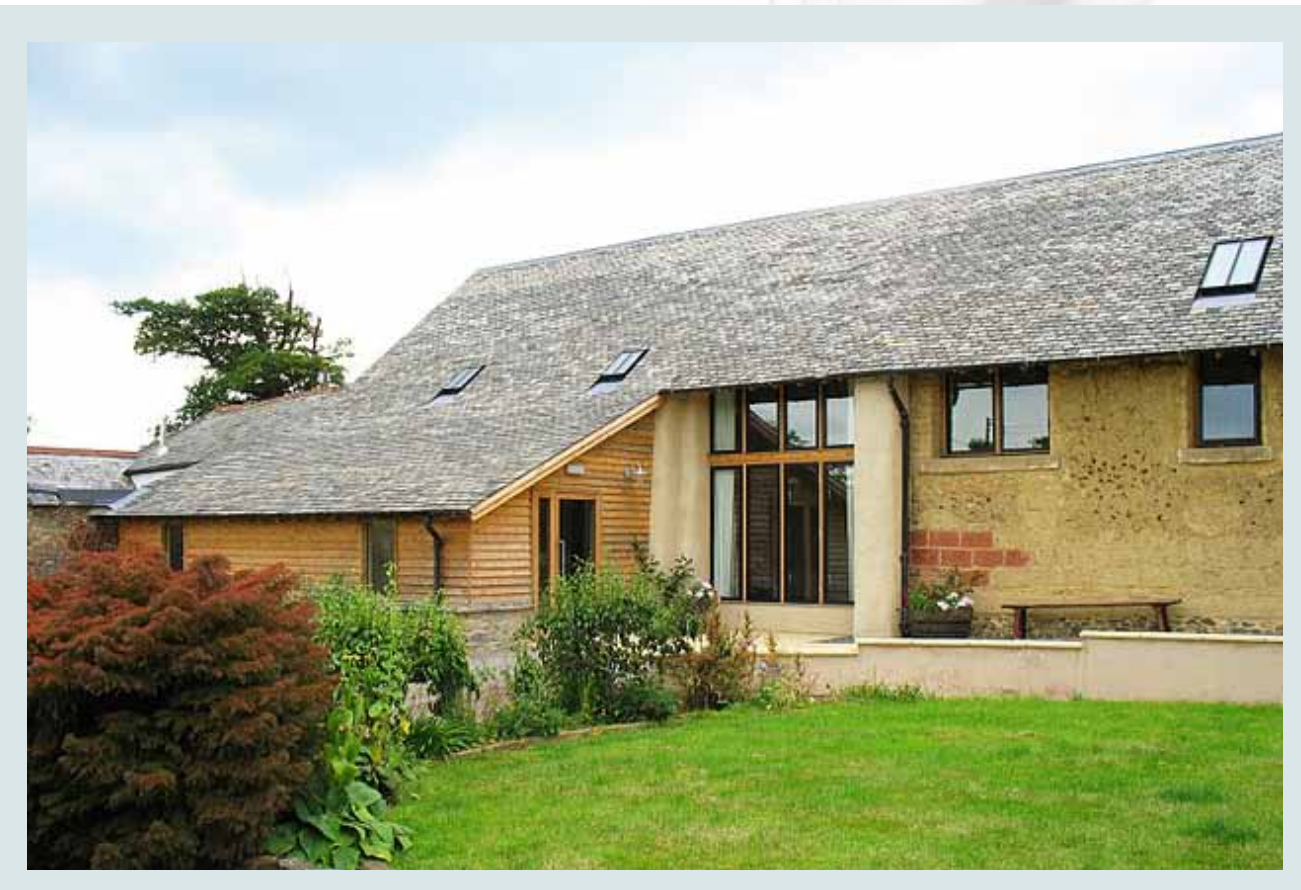
The Conservation Rooflight® has a traditional appearance whilst embracing the latest technical developments and performance standards.

Originally a granary, the 18th century Oak Barn has been transformed into a beautiful wedding venue and holiday accommodation in the Devon countryside. Situated between a grade I listed church and grade II medieval farmhouse it was essential the historic appearance of the barn was restored and the right atmosphere created.